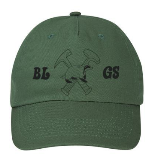
Hats $5, T-Shirts $18